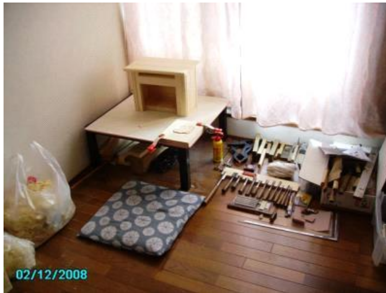
Photo of the 36 Square Feet Shop

I would recommend going for 10x18 if you do have more than 36 square feet of space.